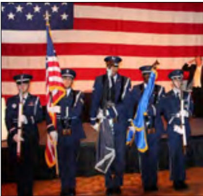
Nellis Air Force Base Honor Guard