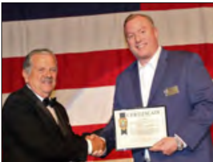
The Orleans Hotel & Casino