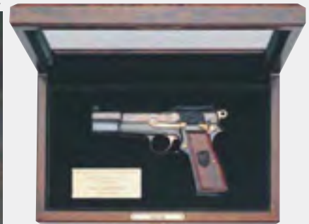
Free Display Case is included with each order for this Tribute. To proudly exhibit and display your Tribute, each pistol will be shipped with a handsome, luxuriously lined display case, with an engraved brass identification plaque. © AHL, Inc.

This Tribute honoring those who served in Southeast Asia is a truly inspiring tribute to America's Special Operations warriors, those who fought, those who fell, and those still listed as missing in action. It is certain to be a treasured heirloom for those who served in Southeast Asia, and for all those Americans who want to remember the brave warriors who proudly served our country.