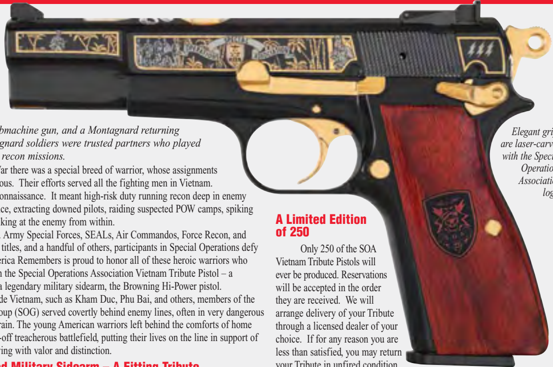
Elegant grips are laser-carved with the Special Operations Association logo.